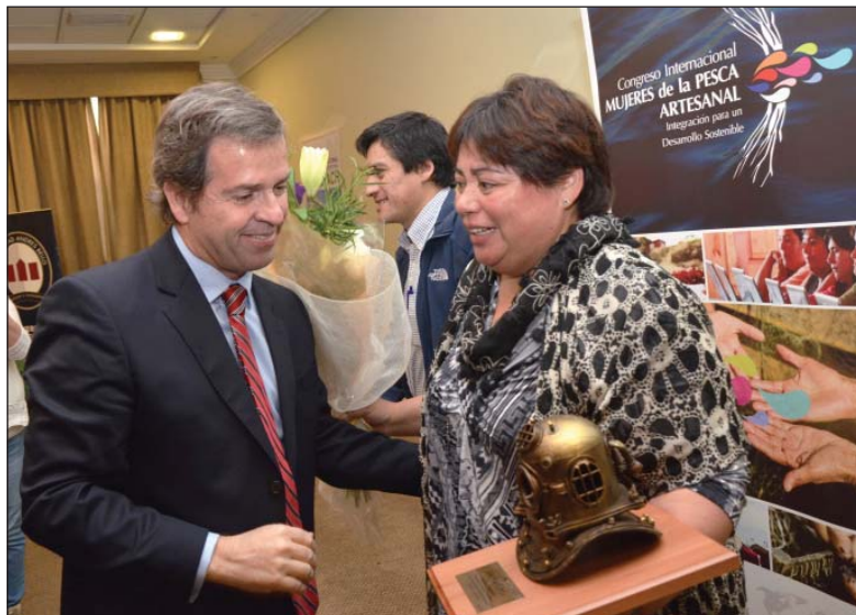
There were 150 women members from CONAPACH at the International Congress of Women in Artisanal Fisheries held in Valparaiso, Chile from 5-7 June 2013