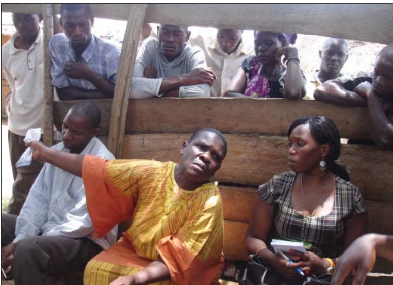
Community dialogues enable KWDT to engage communities in decisionmaking on the access and use of their fisheries resources