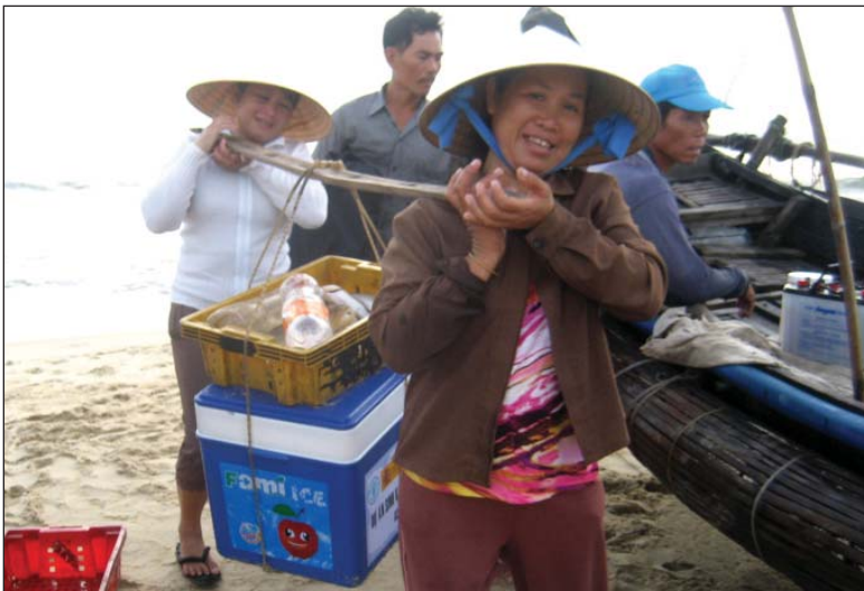
Women in Phong Hai commune, Thua Thien Hue province, with the ice boxes provided by RFLP, Vietnam