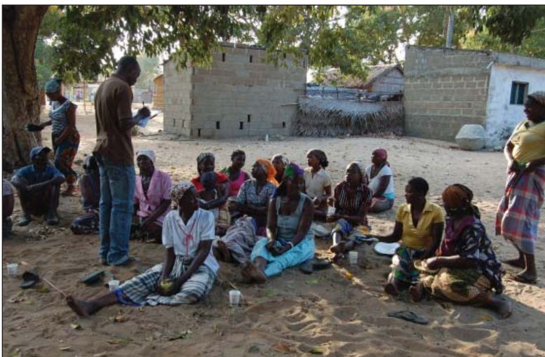
Women in the Conguiana community, Inhambane province, Mozambique engage in post-harvest fisheries activities