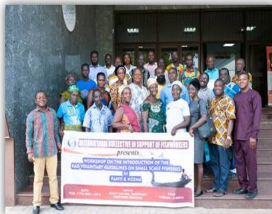
Ghana Mfantse - Nzema