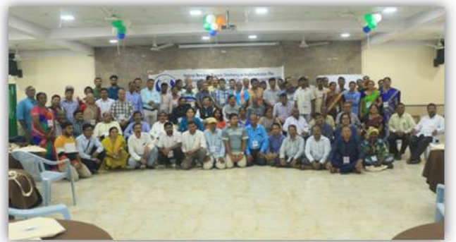
India Inland Fisheries