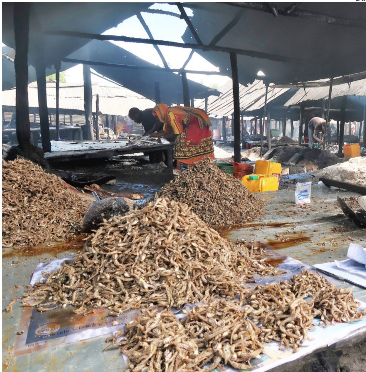
Processing of small pelagic fish in Bagamoyo, Tanzania. The maximum sustainable yield (MSY) for both inland and inshore marine waters stands at about 2.14 mn tonnes per annum; the actual yearly production ranges between 370,000 tonnes and 470,000 tonnes

Agriculture Organization of the United Nations (FAO), plans were put in motion to ensure the noble objectives in SSF Guidelines were put into practical effect.