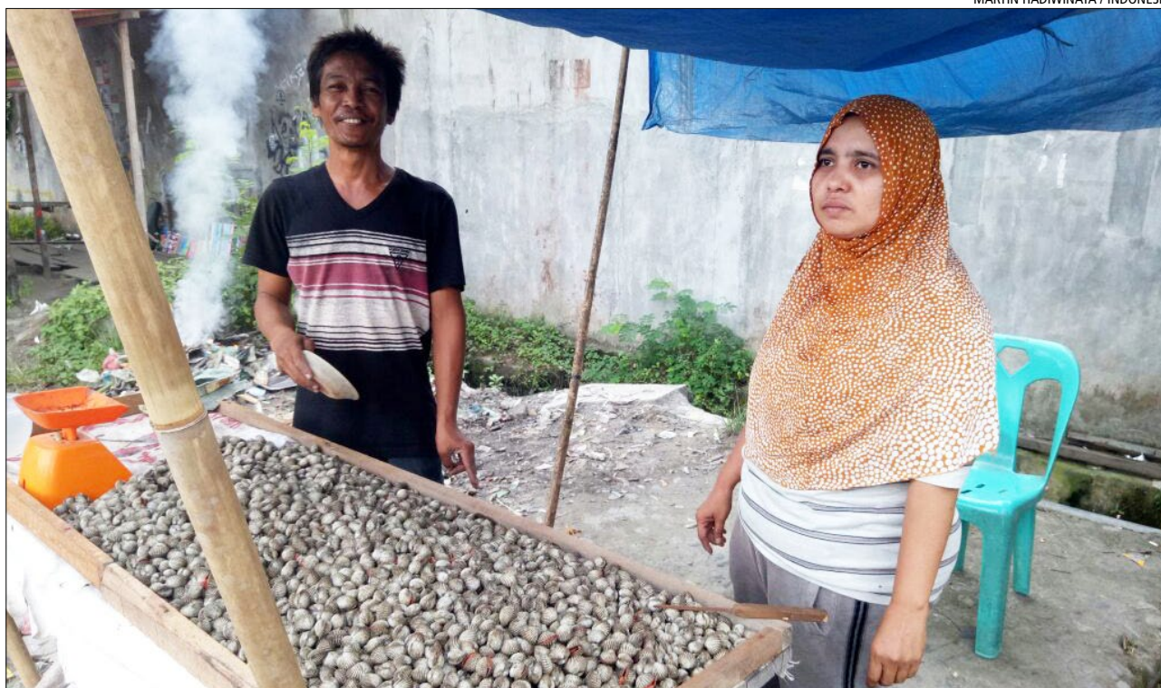
Fishers in Batubara, North Sumatra, Indonesia selling clamshells in the market. Fisher families began pawning possessions to make ends meet and these practices were adopted only in times of famine earlier

Even as fishing continued in one way or another, fish prices plummeted. Fish that went for Indonesian Rupiah (IDR) 250 before the pandemic was barely fetching half that value in the market during the pandemic. Fishermen were salvaging what they could just to buy back fuel oil. Moreover, in certain areas like East Java, fisherfolk went to sea using loan capital from investors—the skippers. They sold their catch to the investor as a form of instalment or return on capital.