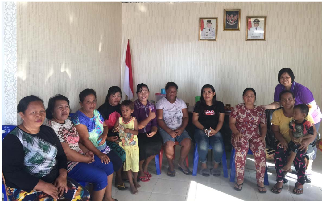
Nain Island, Indonesia