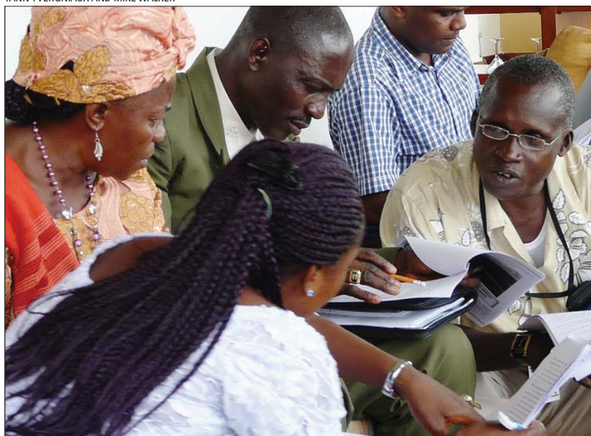
Representatives from Liberia and Sierra Leone discussing the contents of the Banjul Declaration, made on 21 September 2010 in Banjul, The Gambia