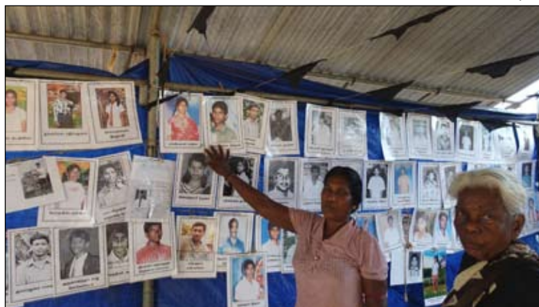
Mullaithivu-women’s protest release list of disappeared children and relatives. War widows and other single women heading households face economic hardships.

Do women face different problems from the men of their community, we ask. The women unanimously answer ‘yes’. Women face huge economic hardships, they say, in particular, the War widows and other single women heading households. Daily labour opportunities in agriculture and fisheries are few and mostly given to men. Daily wages for men are also almost twice as much as for women. Women must walk long distances, sometimes up to six or seven kilometres, for a daily wage job and, despite the lack of safety on the roads, they return home late, after dark. Women are also primarily responsible for household chores, and because wells have dried up due to drought, they have to walk miles to fetch water. Most women take loans, particularly for the education of their children or to set up some small business, and many find themselves deeply trapped in debt. Some women are even forced to go into prostitution for income and food. There are some governmental and NGO income