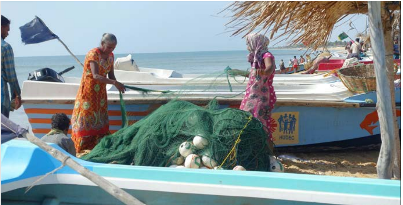
Mullathivu fisherwomen in Northeast, Sri Lanka. Issues of indebtedness are significantly higher in post-conflict areas, and in the North and the East, women are suffering from what they call the household debt crisis