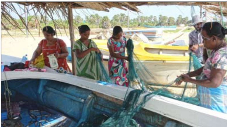
The livelihoods of women here have been further undermined after the War by the hordes of fishing enterprises that have arrived from other regions