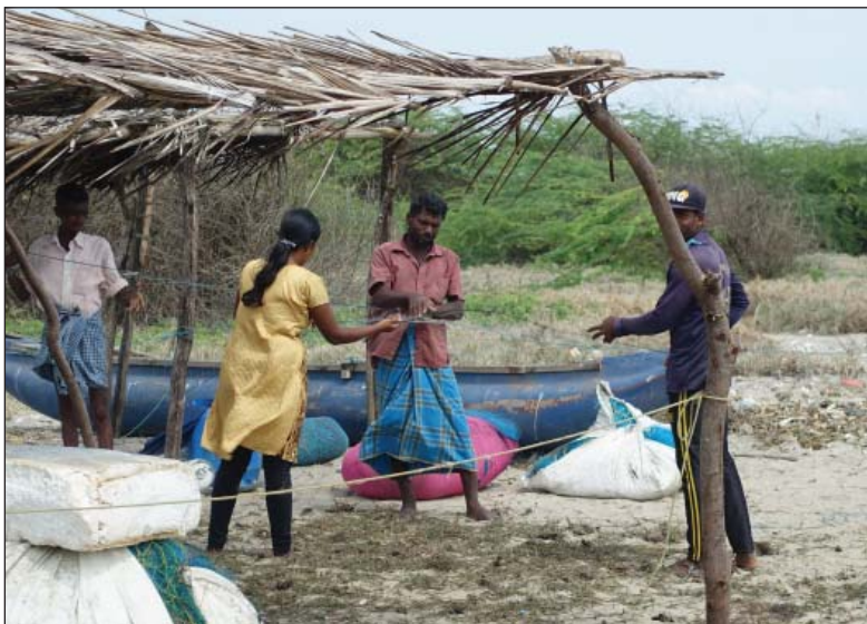
Women helping in cleaning nets, Mannar Island, Sri Lanka. The livelihood of the widows and deserted women is very fragile