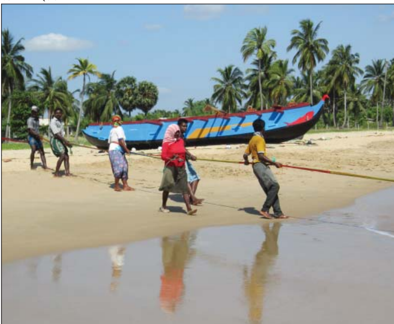
Women in the district of Batticaloa, Sri Lanka would like to see effective fisheries management with their active participation