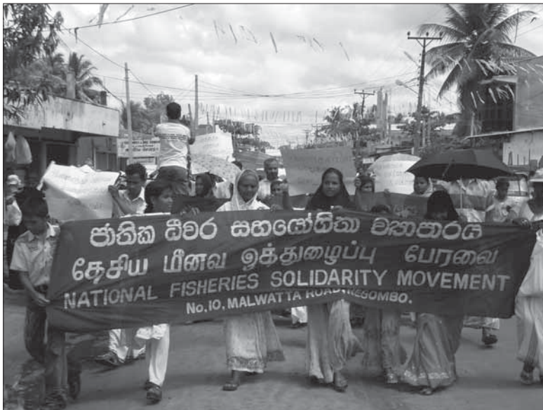
International Women's Day march at Addalachchenai, Ampara District, Sri Lanka.

women of fishing communities, many of whom are now the primary breadwinners of their families, have still not been provided with basic facilities, proper housing and the means of earning a livelihood.